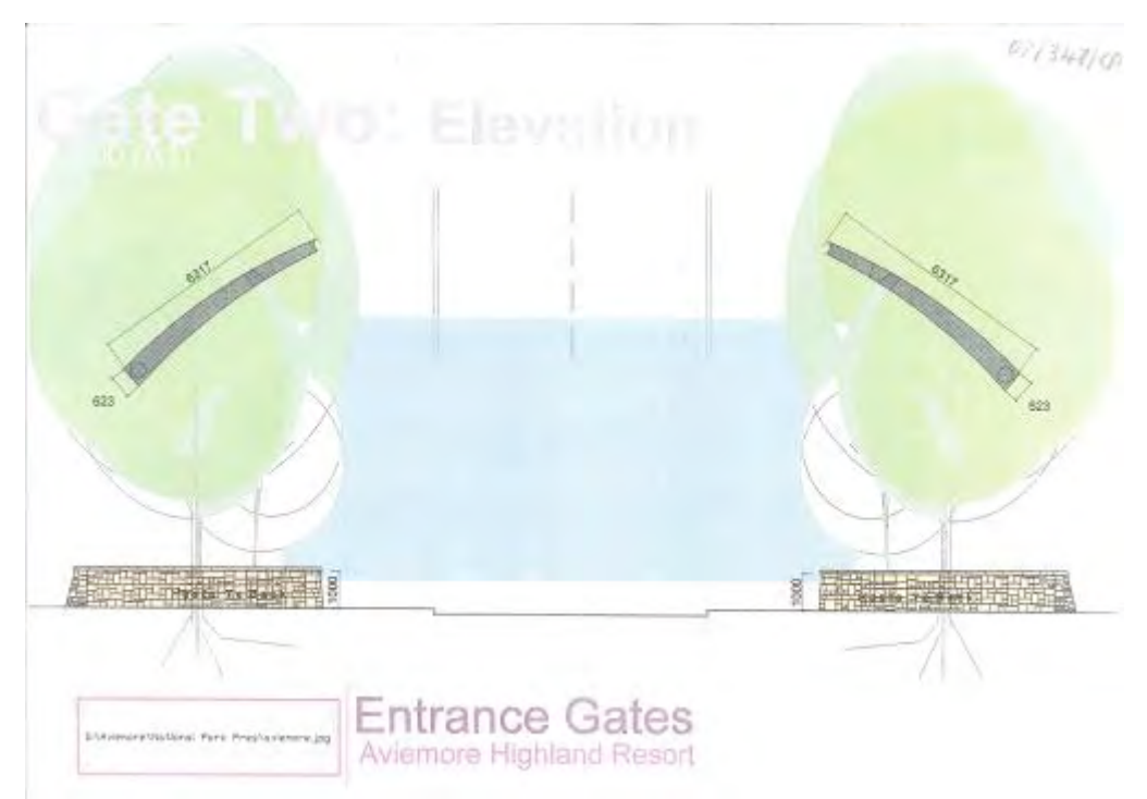
Figure 5. Northern 'exit' feature elevation