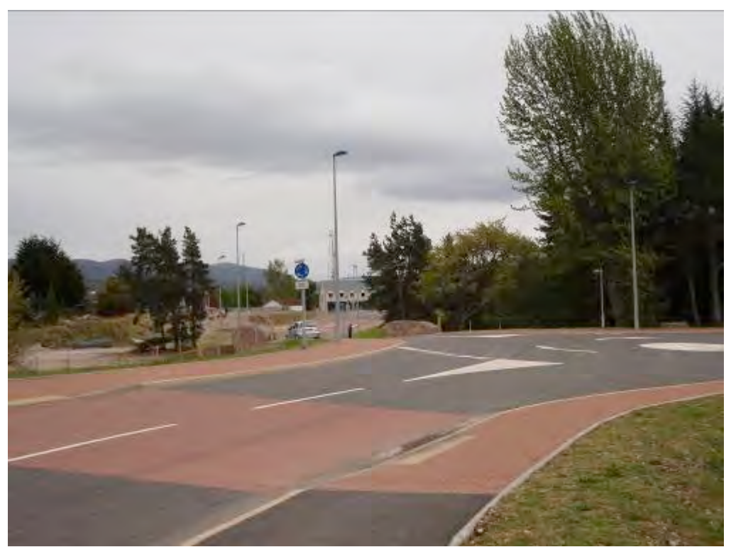
Fig 4. Site for northern 'exit' features either side of exit road.