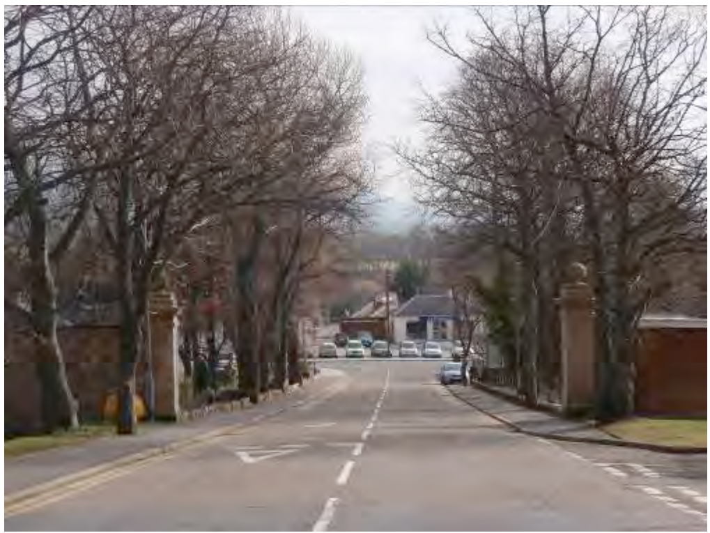
Fig 3. Southern 'entrance' gateway feature rear elevation