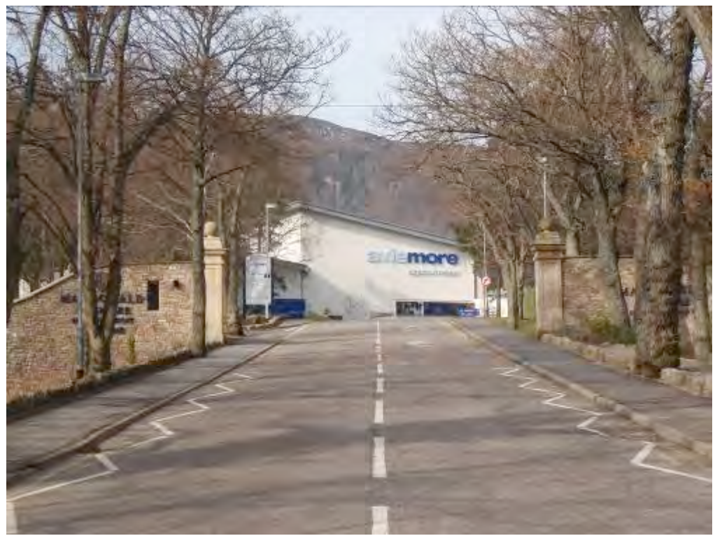
Fig 2. Southern 'entrance' gateway feature front elevation